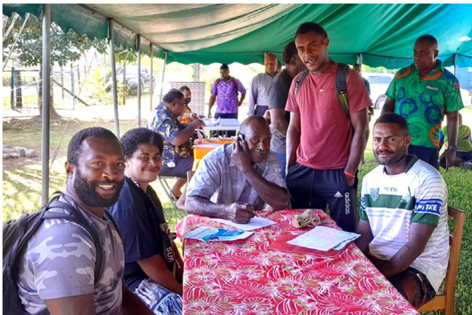
Customers took advantage of the full services on offer at the LTA Keiyasi Roadshow in June.

Additionally, the roadshow featured various products and services from esteemed stakeholders and corporate partners including the iTaukei Land Trust Board, Energy Fiji Limited, Water Authority of Fiji and Fiji Revenue & Customs Service.