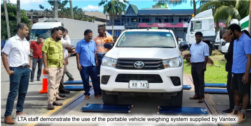
LTA staff demonstrate the use of the portable vehicle weighing system supplied by Vantex Solutions.

The supply agreement specifically covers the provision of six sets of portable motor vehicle weighing systems, which will enhance LTA's capacity to enforce weight regulations and protect road infrastructure.