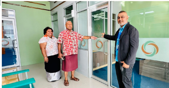
LTA staff at the soft opening of the newly-established Nadi Express Office at Jetpoint, Martintar.