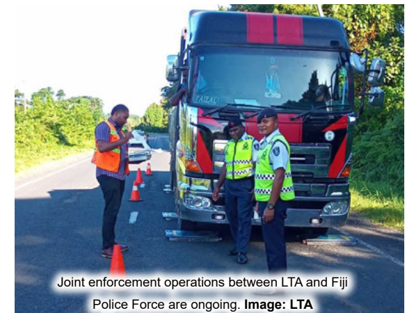
Joint enforcement operations between LTA and Fiji Police Force are ongoing.

Speeding remains a major concern, followed by drink driving, pedestrian faults, dangerous driving, passenger fault incidents, and hit-and-run cases.