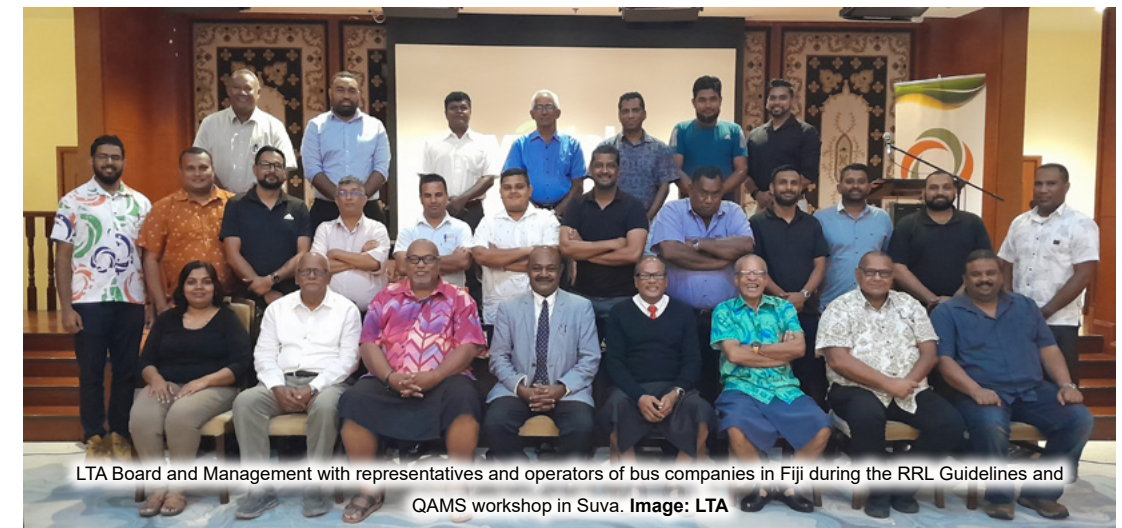
LTA Board and Management with representatives and operators of bus companies in Fiji during the RRL Guidelines and QAMS workshop in Suva.

Representatives and operators of bus companies attended the workshop and explored QAMS requirements, compliance levels, and strategies for fleet growth, showing a commitment to advancing public