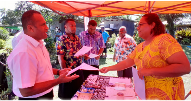
LTA staff conducting awareness and outreach at Nadoria, Rewa.

The Authority's participation in this event reflected its dedication to enhancing road safety and ensuring that rural communities are well-informed and compliant with transport regulations.