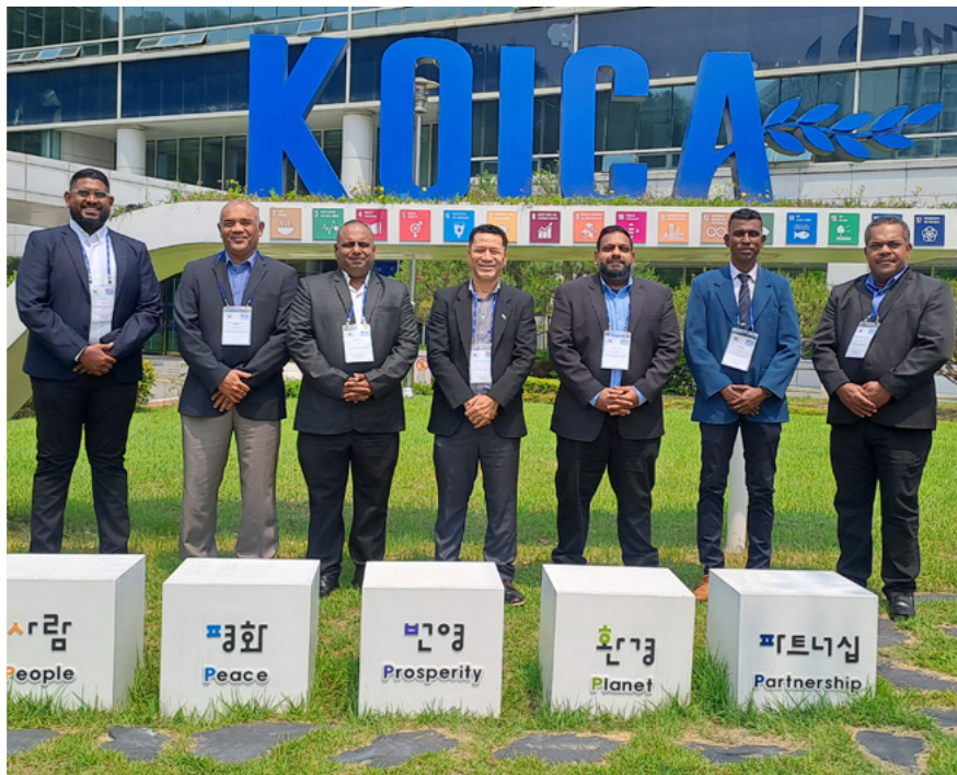
Seven LTA staff members participated in a Capacity Building for Supporting Low Emission Development Strategy & Climate Action Plan In Fiji under the KOICA Program in Korea.

Seven staff members from the Land Transport Authority (LTA) participated in a Capacity Building for Supporting Low Emission Development Strategy & Climate Action Plan in Fiji under the KOICA Program in Korea.