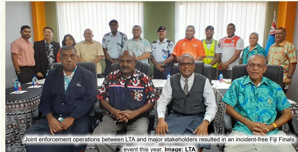
Joint enforcement operations between LTA and major stakeholders resulted in an incident-free Fiji Finals event this year.

The participation of the LTA staff in this program was seen as a significant step towards advancing the nation's environmental and transportation goals.