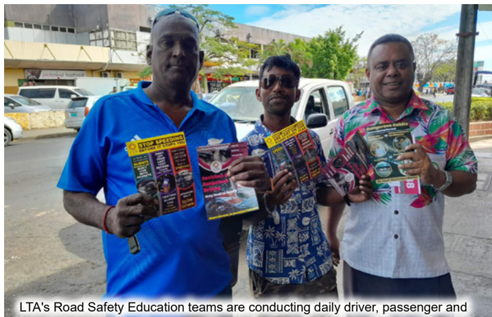
LTA's Road Safety Education teams are conducting daily driver, passenger and pedestrian awareness in communities and schools as part of efforts to keep Fiji's roads safe.