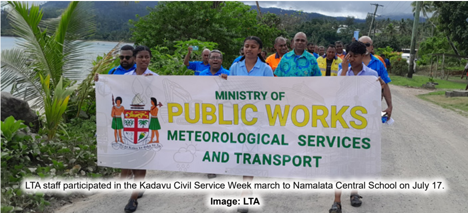
LTA staff participated in the Kadavu Civil Service Week march to Namalata Central School on July 17.

Customers on Kadavu took advantage of the full services offered by the Land Transport Authority during the Official Tour of Kadavu by Honourable Minister for Public Works, Meteorological Services, and Transport, Ro Filipe Tuisawau from July 15-19.